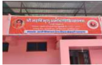
UTTARKASHI December 2016