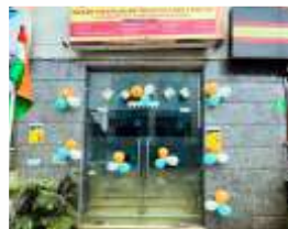
DELHI September 2022