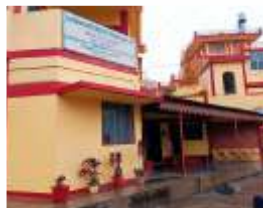
DUMET December 2021