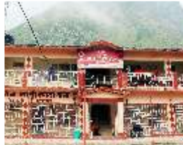
SHRI BADRINATH DHAM May 2019