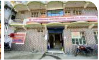
BARKOT September 2017