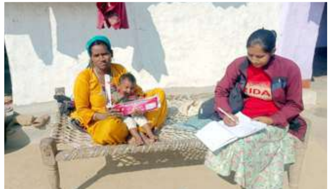
My Pad Programme