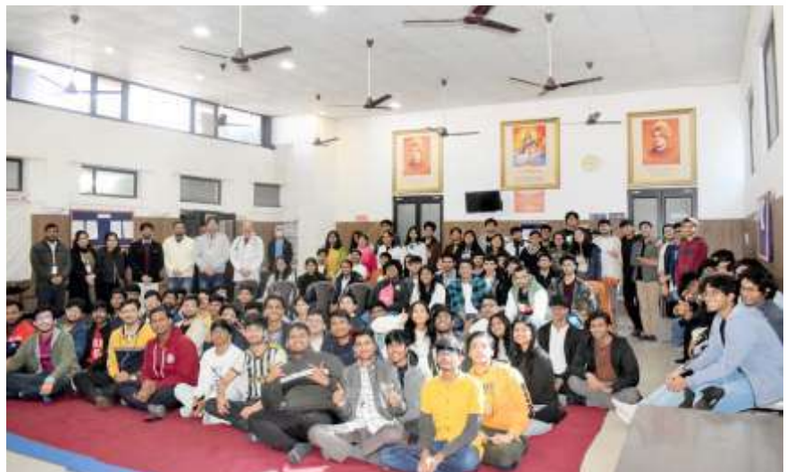
AIIMS Delhi Students