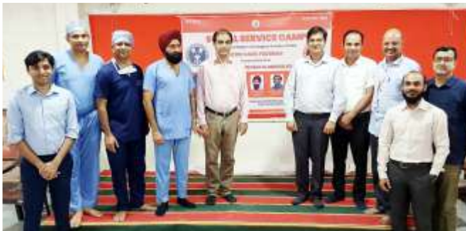
NZUSI Uro Camp, Dharmawala