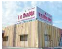
FIROZABAD February 2024