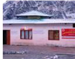
SHRI KEDARNATH DHAM September 2019