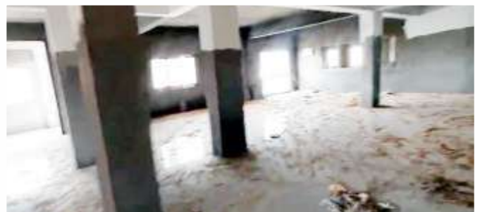
Some pictures of the hospital under construction