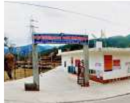
PESHAL July 2019