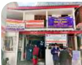
GANGOTRI DHAM September 2021