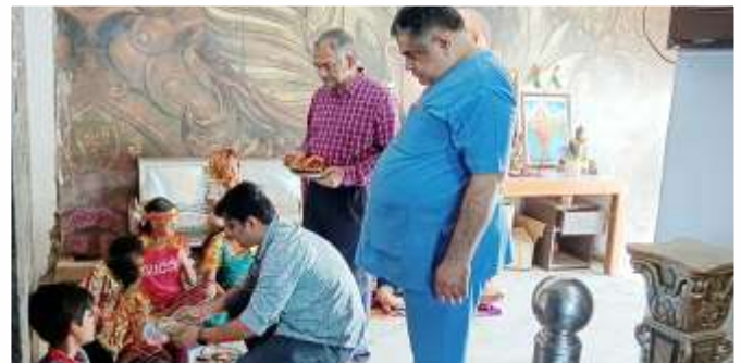
Navratri Kanya Pujan, Delhi