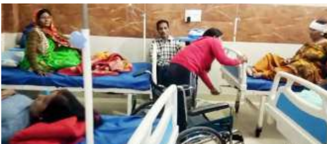
Accident Victims under Treatment

On the 26th October around 6 pm, a mini bus carrying passengers from Delhi to Jageshwar Dham met with an accident in village Kalidhar near Petshal resulting in injuries to 21 passengers. All the 21 accident victims were brought to Petshal hospital, out of which 7 had head injuries, 8 had fractures in their upper limbs and 1 had a broken rib. All the victims were admitted and treated with full compassion and care. There was no loss of life and all of them were discharged post recovery.