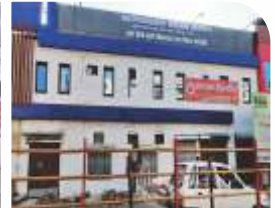
HARIDWAR January 2021