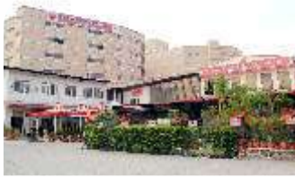
DHARMAWALA September 2012