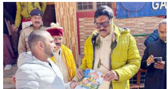
Hon'ble Shri Bhushan Ramkrishna Gavai Ji being presented with the Society's newsletter

Judge of the Supreme Court of India, Justice Honorable Shri Bhushan Ramkrishna Gavai Ji visited the medical outpost of our hospital located in the temple premises and inquired about the various hospitals of Swami Vivekanand Health Mission Society. He praised the dedication of the hospital and wished to provide even better health services in future.