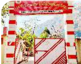
PIPALKOTI January 2018