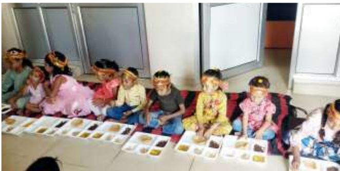
Navratri Kanya Pujan, Petshal