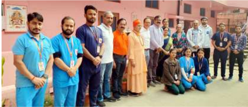
Volunteer Doctors Team