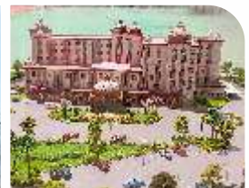
VRINDAVAN June 2024

Founded in the year 2012 by a group of young Doctors and some philanthropists, Swami Vivekanand Health Mission Society is continuing its mission of providing high quality charitable health care to mankind. The Society started its journey by establishing their first charitable project in the form of a small clinic at Dharmawala, a tribal dominated village, situated 40 km from Dehradun, Uttarakhand and bordering the states of Himachal Pradesh and Uttar Pradesh.