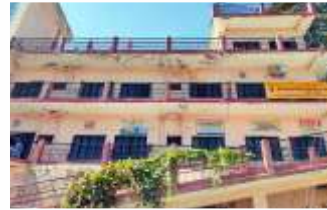
NARAYANKOTI May 2017